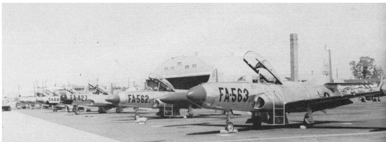
Squadron F-94s on the flightline.

On 1 April 1998, the squadron was reactivated as the 96 Flying Training Squadron, Laughlin AFB, Texas as a Reserve Associate Squadron, Air Force Reserve Command. The 96 FTS was the first squadron in the Air Force with Instructor Pilots teaching SUPT student pilots in all three trainer aircraft - the T-37, T-38 and T-1. In December of 2004, the 47th Flying Training Wing completed the transition from T-37 aircraft to the T-6 Texan II.