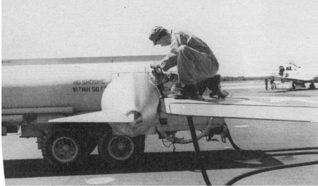
Refueling an F-94